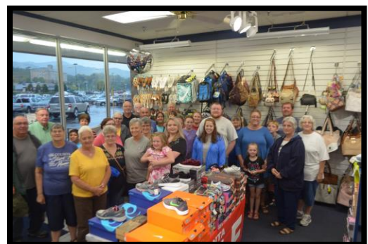
Balsam Baptist Church volunteers for the Back to School project.